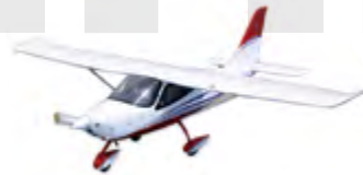
P2008JC MkII CS-VLA